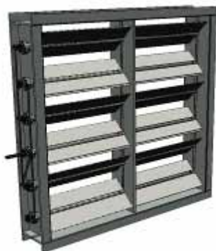
CJVK For demanding applications