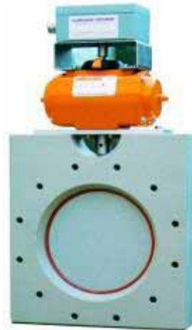
Shutoff flap with pneumatic actuator