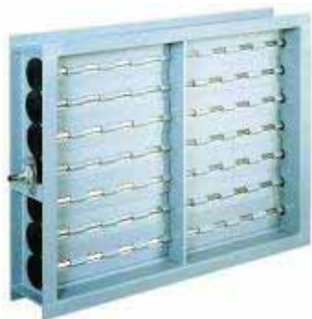
CJK For light applications