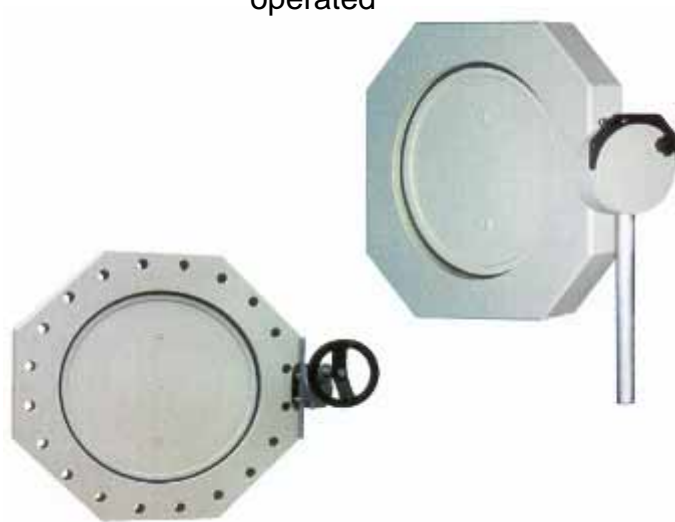
Shutoff flap with worm-gearing, manually operated