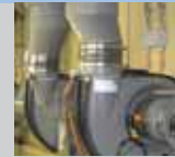
Shutoff flap with lever, manually operated